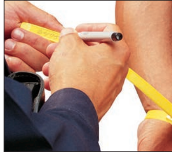
Tri-Folds® feature a recessed identification plate and textured writing surface.